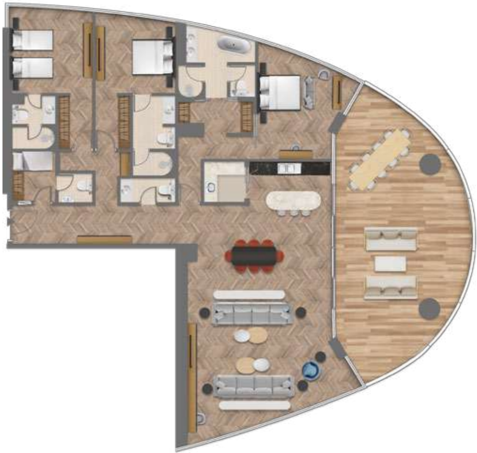
3 BEDROOM APARTMENT, TYPE B